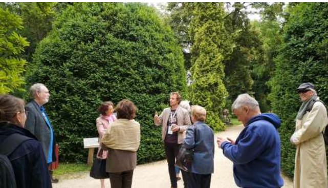
In one of Poznań's many parks

KAM: I think so. But the question of possible new applications is the responsibility of the CISH Board.