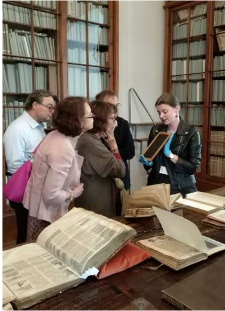
Exploring the treasures in the library of Poznań University

Q: The new congress will be held from 22 to 28 August 2021. What is the timetable until then? What is the new deadline for registration, what are the agreements with the hotels that people can book for next year? Will there be a regular update of all these details on the conference website?