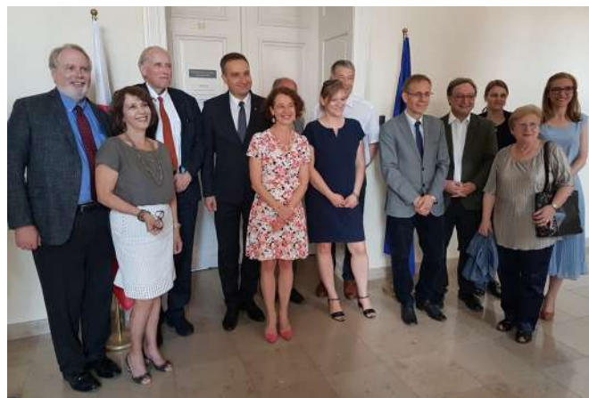
The CISH board at the reception with the mayor of Poznań

KAM: Historians have probably the same problems as other people. Fear, uncertainty, isolation from others, disorganization of life. We also face research and teaching limitations. All conferences have been canceled. On the other hand, we have the opportunity to continue (finish) projects for which we usually did not have enough time. Certainly some interesting books will be written. Of course, historians see a little more than others. And today we can see that a pandemic will affect almost everything – demography, because it mainly affects old people, the economy, culture, education. The world will change again.